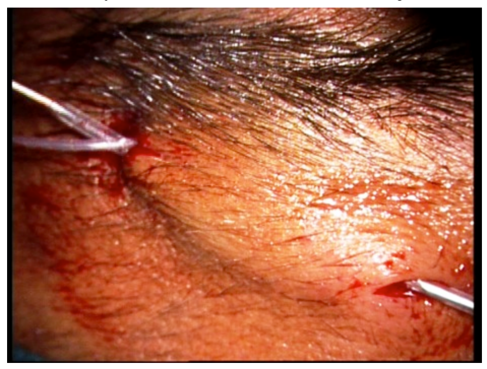
Fig. (4). The needle is docked into the catheter and the catheter is pulled out carrying the needle attached to the silicon rod.