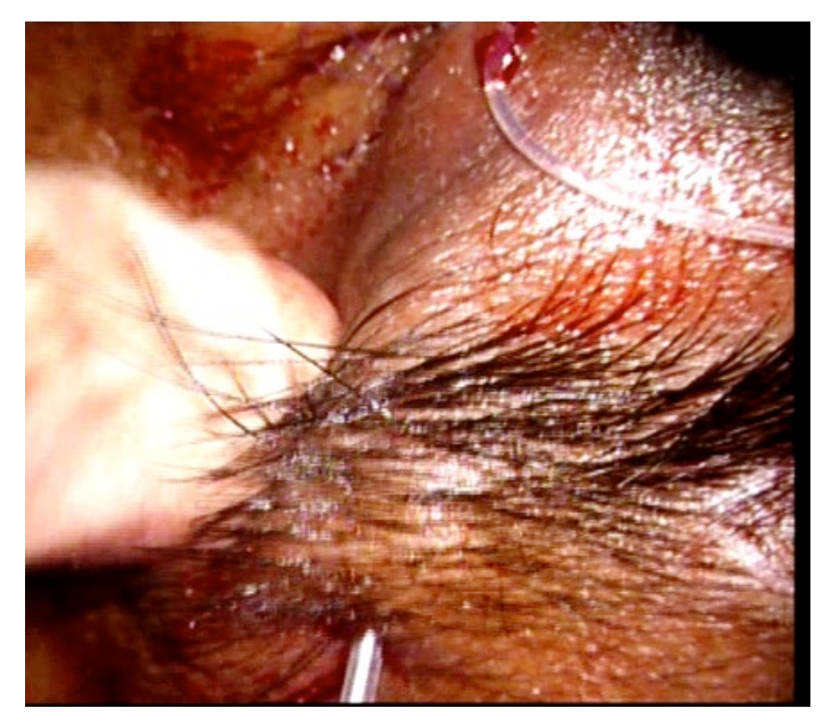
Fig. (1). The 18 G intravenous catheter is passed from the superior brow incision to exit at the lid marking.

was then passed through the sleeve and tightened at the forehead to lift the lids to achieve the desired lid height and contour. The ends of the sling were trimmed. The sleeve was then buried in the superior forehead incision to prevent extrusion. The superior incision was then sutured in 2 layers using 5-0 vicryl and 6-0 silk. The other incisions were left to heal as such. Similar procedure was repeated on the other eye. Frost sutures were applied.