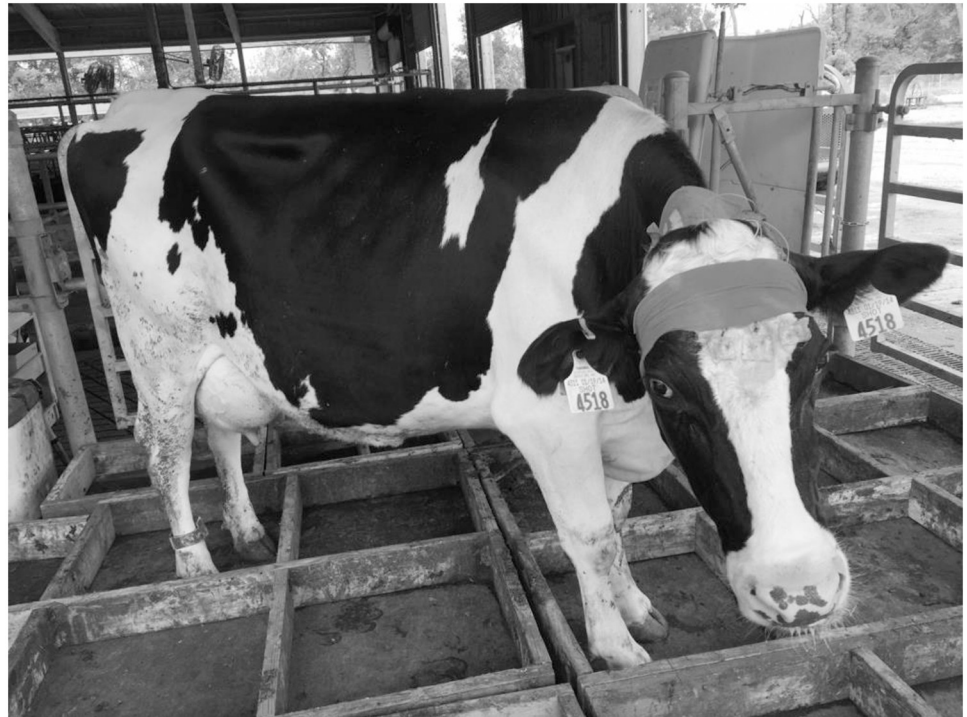
Fig 1. Cow housed on lying deprivation treatment containing wooden grid.

https://doi.org/10.1371/journal.pone.0212823.g001