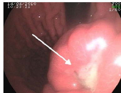
Figure 1: Orifice of the fistula with pus drainage into the lesser curvature. (arrow)

fistula was discovered in the lesser curvature which was draining pus into the gastric lumen (Figure 1).