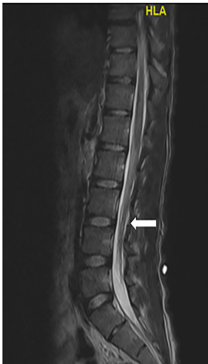
Image. T2-weighted magnetic resonance imaging of the spine. Lower spinal sagittal windows demonstrate diffuse enhancement of the cauda equina (white arrow).

remained negative. Cryptococcal, human T-lymphotrophic virus 1, and herpes simplex virus testing were negative.