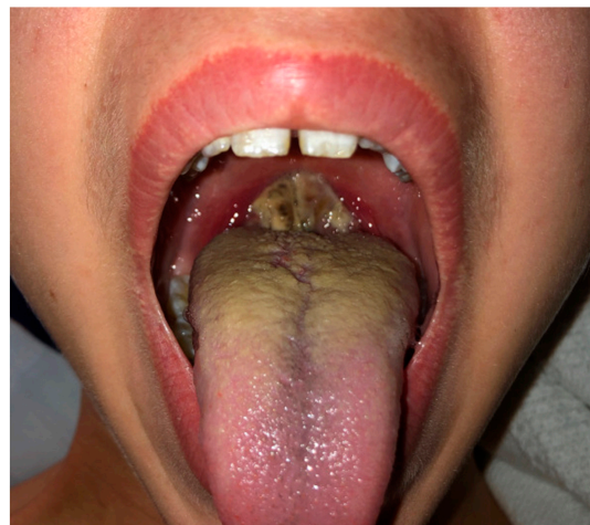
Figure 1. Oropharyngeal examination showing bilateral tonsillar enlargement with exudates.

ensured. Discharge medications consisted of tacrolimus, mycophenolate, valganciclovir, TMP-SMX and factor IX replacement therapy.