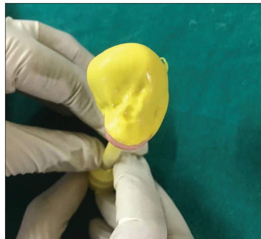
Figure 2: Impression using light bodied impression material

A 60-year-old male patient reported to the Department of Prosthodontics and Crown and Bridge, Subharti Dental College and Hospital, Swami Vivekanand Subharti University, Meerut (Uttar Pradesh) with the chief complaint of ill-fitting artificial right eye. The patient was a prosthetic eye wearer for 20 years. Examination revealed enucleated socket with no signs of inflammation [Figure 1]. Custom-made ocular prosthesis has many advantages when compared to stock eye prosthesis such as better adaptation and characterization of the eye. There are various methods to locate iris. In the present case, two methods were chosen to locate iris for customized ocular prosthesis to find out which was more accurate, simple, and expectable method.