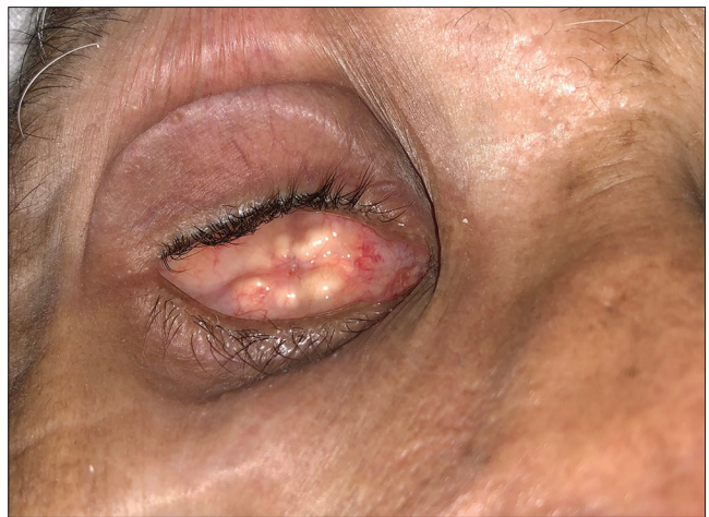
Figure 1: Preoperative