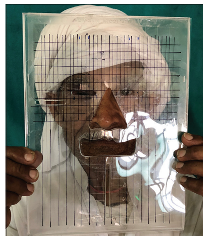
Figure 4: Iris location using trubyte tooth indicator

Both the prostheses were tried by the patient; however, the prosthesis with trubyte tooth indicator method showed a better orientation of the iris with respect to the contralateral eye [Figures 6 and 7]. The method was easier and did not require elaborate equipment which needed to be adjusted. In addition, the time taken was much less