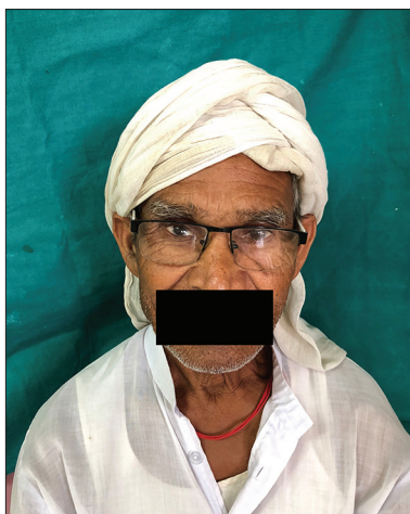
Figure 7: Final prosthesis using Hanau wide view spring bow