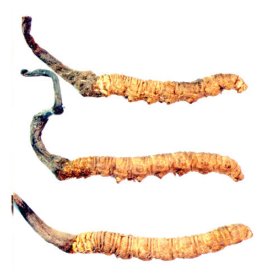
Figure 1. Wild DongChongXiaCao (black part: the fruiting body; brown part: the caterpillar corpus)

The caterpillar fungus Ophiocordyceps sinensis (syn. Cordyceps sinensis ) is one of the entomogenous Ascomycetes and parasitizes the larvae of Lepidoptera to form the well-known traditional Tibetan medicine "yartsa gunbu" or, in traditional Chinese medicine, "DongChongXiaCao (冬蟲夏草 Dōng Chóng Xià Cǎo)"("winter worm-summer grass," [Figure 1]). DongChongXiaCao is a well-described remedy that has been used in traditional Chinese medicine for over 700 years.<sup>[1]</sup> The wild fungus, which possesses a plant-like fruiting body and originates from dead caterpillar that fill with mycelia [Figure 2], has generally been called C. sinensis or Cordyceps spp. ("ChongCao" in Chinese) due to its insect-shape appearance. O. sinensis (previously named C. sinensis ) is a slow-growing fungus and needs to be grown at a comparatively low temperature, i.e., below 21°C. Both temperature and growth rate are crucial factors that identify O. sinensis from