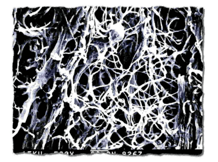
Figure 2. Scanning electron micrograph of mycelia filling the inside of a fruiting body of wild DongChongXiaCao

Figure 3. Scanning electron micrograph of mycelia from the medium of a submerged culture of Ophiocordyceps sinensis