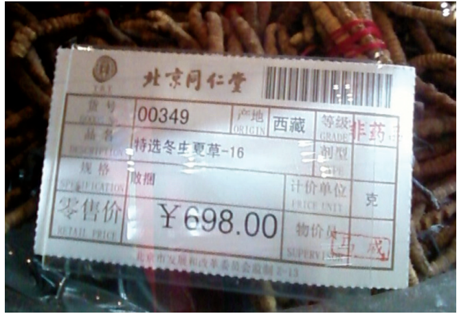
Figure 4. Label showing the precious price (CNY ¥698 per gram) of wild DongChongXiaCao sold in August, 2012 in Beijing, China

Figure 3. Scanning electron micrograph of mycelia from the medium of a submerged culture of Ophiocordyceps sinensis