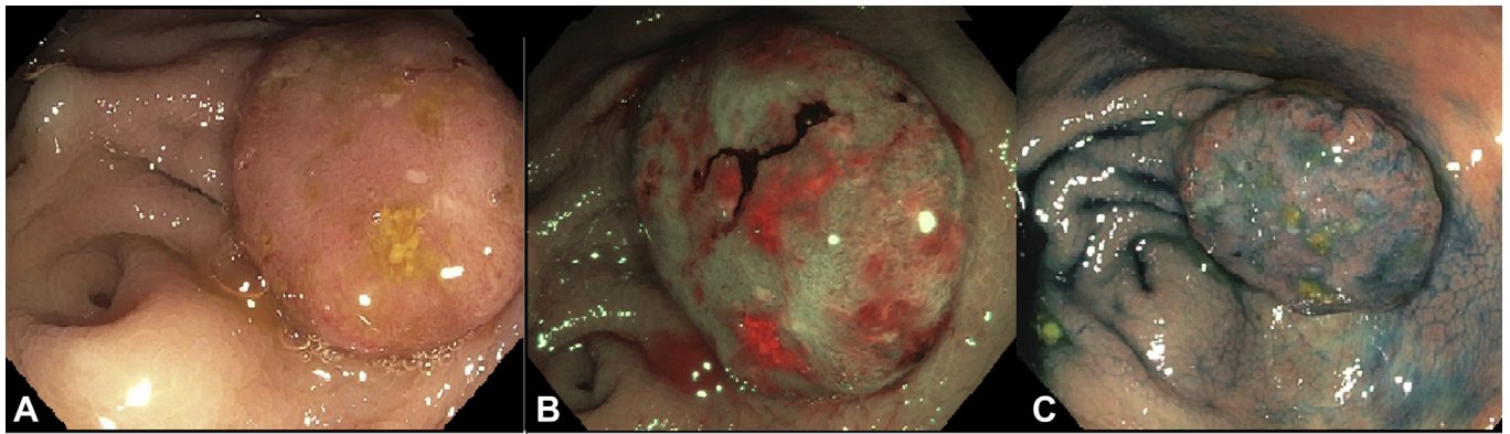
Figure 3. Cecal polyp with an advanced Kudo pit pattern seen by high-definition white light (A), narrow-band imaging (B), and methylene blue chromoscopy (C).