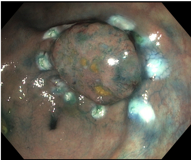
Figure 4. Cecal polyp after thermal markings in preparation for full-thickness resection.