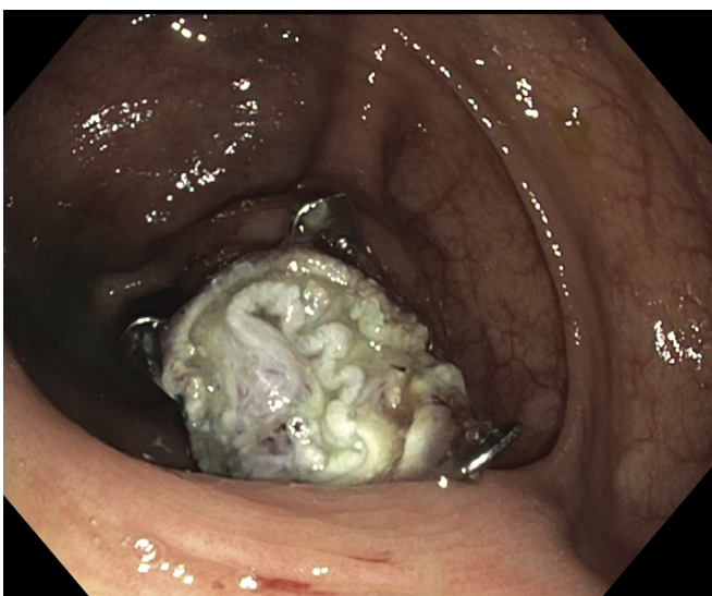
Figure 5. Base of resection site after full-thickness resection showing the over-the-scope clip and muscle and serosal tissue.