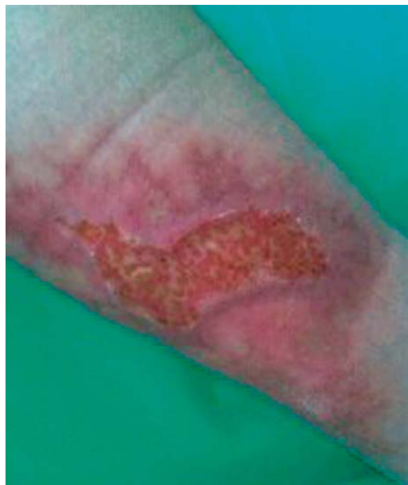
Figure 4. Healed pyoderma gangrenosum

ularly on the upper limbs and trunk, the clinician should suspect an etiology other than PG [12]. The histopathologic findings of PG are not specific; the primary objective in obtaining a biopsy specimen is to rule out other causes of ulceration. A biopsy taken from early lesions shows moderate perivascular infiltrate and endothelial swelling. Skin biopsy specimens, taken from the necrotic, undermined ulcer border of an active lesion, reveal mixed cellular inflammation with neutrophil predominance. A biopsy from an erythematous region adjacent to the ulcer may show vascular necrosis and thrombosis, erythrocyte extravasation and predominantly lymphocytic infiltrates [1, 2].