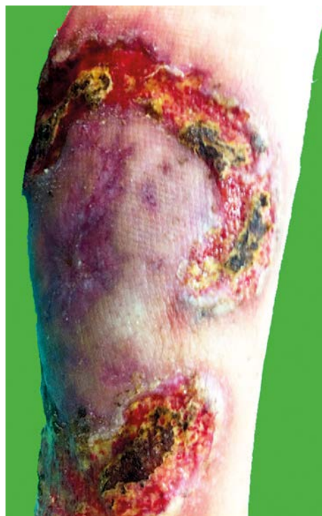
Figure 2. A large necrotic ulcer with typically violaceous, irregular, undermined borders on the leg