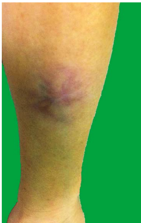
Figure 1. Scar on the forearm after healing the abscess in the site of Mantoux test (pathergy sign)

The bone marrow trepanobiopsy showed an increased number of plasma cells. The patient was initially treated with prednisone (40 mg daily; 0.8 mg/kg b.w.) with rapid clinical improvement. After reducing the daily dose of prednisone to 20 mg, the ulcer recurred. Next treatment was prednisone (60 mg/day; 1.2 mg/kg b.w.) and dapsone 50 mg daily was added as a steroid-sparing and non-suppressive agent. 0.1% tacrolimus ointment was applied topically once daily. Significant improvement in the clinical status was noticed after 3 weeks of treatment when the ulcer diameter reduced to about 2 cm, but one month later several new ulcerations appeared on the left leg. Simultaneously to reducing gradually the dose of prednisone, cyclosporine A was applied in dose