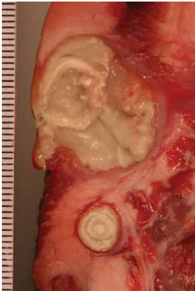
Figure 2. Pseudotuberculosis-like caseous abscesses caused by Corynebacterium ulcerans in wild boar S28/3/13. Scale is shown in millimeters.

were nontoxicogenic tox -bearing (NTTB) strains as shown by positive tox -PCR, and negative Elek test and Vero cell cytotoxicity results. Partial rpoB and partial tox sequences for all 13 isolates were identical to those submitted to GenBank for C. ulcerans strain CVUAS 4292 (accession nos. GU818735 and GU818742, respectively [5]).