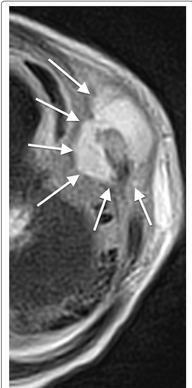
Fig. 2 Rib osteomyelitis: magnetic resonance imaging. The axial T2-weighted image shows a fluid collection with high signal intensity, encasing the anterior portion of the seventh left rib (white arrows). The rib is deformed and fragmented, with bone marrow hyperintensity

Awareness of the increasing community-acquired MRSA infection rates may help to optimize therapeutic strategies.