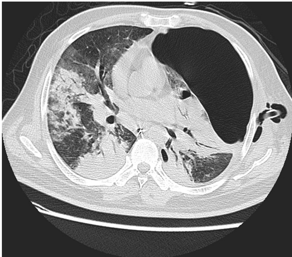
FIGURE 1: Selected axial CT image showing extensive bilateral consolidation and large left pneumothorax

On the second day of his admission, he developed a left pneumothorax, and a chest drain was inserted. Analysis of pleural fluids revealed a PH of 6.53 and pleural fluid lactate dehydrogenase (LDH) of 16872 U/L (Table 2). Two days later, respiratory and pleural fluids showed gram-negative bacilli, which were later identified using the VITEK® MS (bioMérieux Clinical Diagnostics, Durham, NC) as B. pseudomallei , which was susceptible to ceftazidime, meropenem, and trimethoprim-sulfamethoxazole. On the other hand, it was resistant to gentamicin and amikacin. The patient was critically ill in the ICU and was on maximum ventilatory support; antibiotics were changed to meropenem and trimethoprim-sulfamethoxazole. As three, consecutive, respiratory acid-fast bacilli smears were negative, anti-tuberculosis medications were stopped. The patient slowly improved until he could be discharged to the general medical ward. On Day 18 of hospitalization, he spiked a fever of 39°C. Sputum culture was taken, which showed Aspergillus fumigatus . Serum galactomannan was taken as well, which revealed positive results of 0.65. A CT scan of the chest showed a large right upper lobe cavity with an irregular nodular wall suggestive of fungal infection, which was not found in the initial imaging (Figure 2).