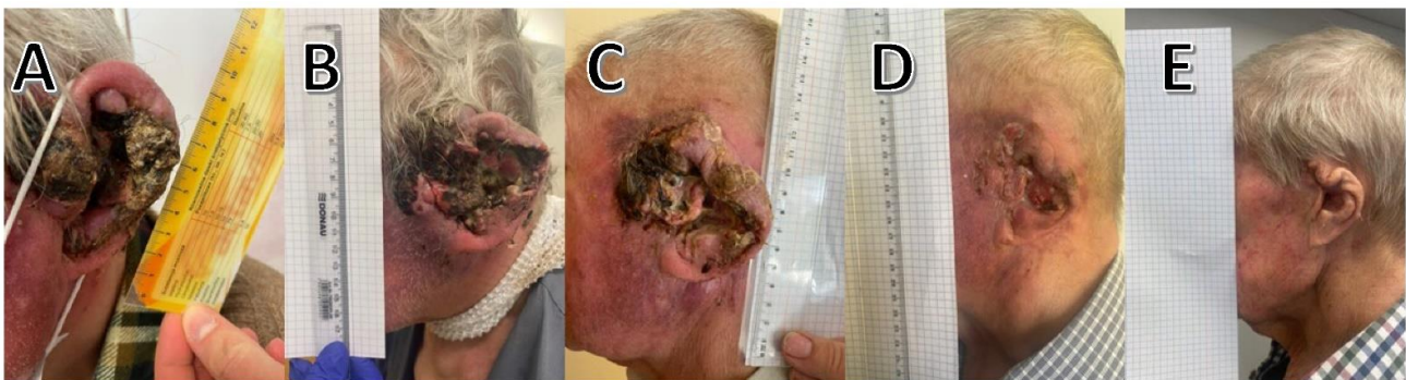
Figure 1. (A) Rapidly growing cutaneous mass on the patient's right ear, visible infiltration of the tissues of the right cheek; (B) ulcerative mass prior to therapy; (C) healing ulcer base with scarring after one dose (3 weeks) of cemiplimab; (D) lesion after 3 doses (9 weeks) of cemiplimab; (E) complete response after 18 weeks of cemiplimab (6 cycles).