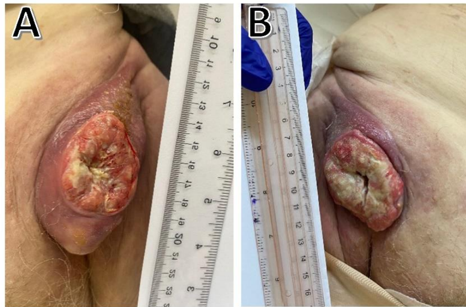
Figure 3. (A) Before treatment; (B) after 3 administrations of cemiplimab (6 weeks).