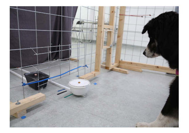
Figure 2. Test setup for quality condition. The dog is waiting for the black bowl, which contains the high value reward (in this case sausage) and resists from eating the low value reward (in this case dry food) from the white bowl.

experimenter had removed her hands from the sticks, the dog was released and free to choose one bowl. As soon as the dog approached a bowl, the other was moved back and covered by the experimenter. The dog was allowed to eat the treat and then was called back by the owner and the next trial started. No choice criterion was set, since the purpose of these trials was simply to familiarize dogs with the bowls and their movements as well as build up the expectation of finding food within them. 12 trials were conducted; the side of rewards was counterbalanced and semi-randomized with the exception of having one reward no more than twice in a row on the same side. Two sessions were conducted, one before starting with the quality condition (LQR vs. HQR). In the quantity session we conducted 6 trials with LVR rewards and 6 trials with HVR rewards, which were semi-randomly interspersed (no more than twice in a row).