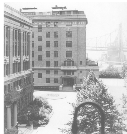
Rockefeller Hospital, 1946.

found that treatment of the group A carbohydrate with the latter enzyme abrogated its reactivity with group A antiserum but made it reactive with the variant antiserum. His interpretation of these results was that the group A carbohydrate was composed of an undetermined number of rhamnose side chains with a terminal N -acetyl-glucosamine and that the variant carbohydrate lacked the terminal N -acetyl-glucosamine (14). The linkage to the rhamnose could be either \alpha or \beta ; however, this could not be resolved at that time. Six years later, using the azo antigen technique, in which p -aminophenyl- \beta - N -acetyl-glucosamine could be linked to egg albumin, he showed that this complex and not the \alpha form was reactive with the group A antisera (15). He went on to show that the phenyl- \beta - N -acetyl-glucosamine and not the \alpha form could induce the cleaving enzyme from the soil organism. From this he concluded that \beta - N -acetyl-glucosamine side chains represent the major antigenic determinant of group A streptococci. Decades later, his structural interpretation was proven to be entirely correct based on the NMR structure of these carbohydrates (16, 17).