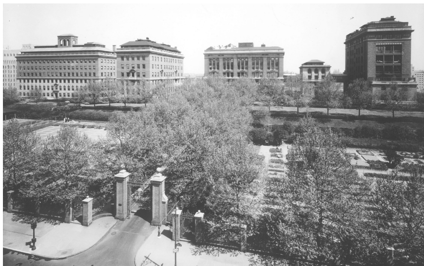
Rockefeller University, 1937.