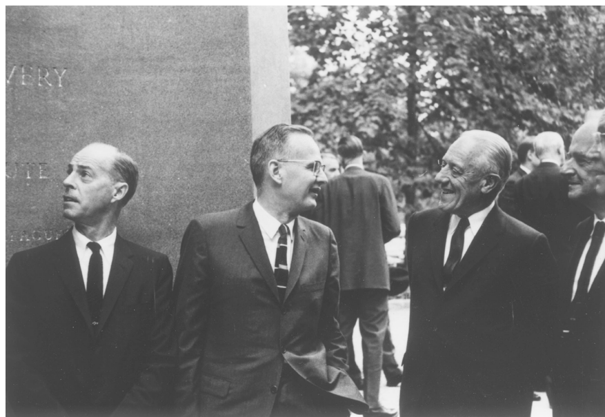
Colin MacCleod, Maclyn McCarty, and Detlev Bronk, 1965.