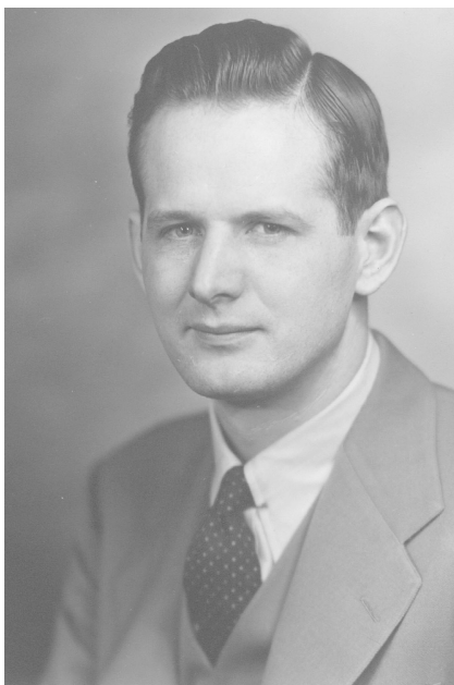
McCarty, 1942.

The rabbit antiserum to crystalline CRP proved a much more sensitive