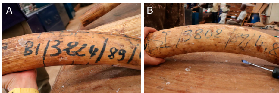
Fig. 2. (A) Specimen with markings from the UG19A ivory seizure indicating country code/serial number/year/weight (in kilograms). See Parker (9) for discussion of CITES markings on the Burundi ivory stockpile. (B) Second specimen from UG19A ivory seizure.

We supplemented the modern calibration dataset of Cerling et al. (5) with specimens of hair collected from East Africa over the period 1999–2019 to extend the