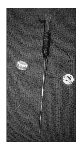
Fig. 1. A photograph of a deployed t-fastener (left) and a t-fastener needle containing an undeployed t-fastener.

All procedures were performed in the interventional radiology suites by an attending physician or a fellow under the direct supervision of an attending physician. Patients were administered barium orally or via a nasogastric tube the day before the scheduled procedure in order to allow opacification of the transverse colon. Radiographic confirmation of such opacification was required prior to initiating the procedure. Moderate sedation was achieved using midolazam and fentanyl. Prophylactic antibiotics were not routinely administered. The stomach was insufflated with air via a nasogastric tube. If an adequate window for gastric access was available below the costal margin and above the transverse colon, then the procedure was initiated. If no adequate window was present, then the procedure was aborted and considered a technical failure. For local anesthesia, 1% lidocaine was utilized. Two to four t-fasteners (Saf-T-Pexy; Kimberly-Clark, Roswell, GA, USA) were then used to perform gastropexy at separate sites around the planned access site (Fig. 1). The number of t-fasteners used was at the discretion of the attending physician. At the center of the gastropexy, the stomach was accessed with an 18-gauge needle. For gastrojejunostomy tubes, transpyloric access to the proximal jejunum was obtained using a 5-Fr angled catheter and guidewire. Tract dila-