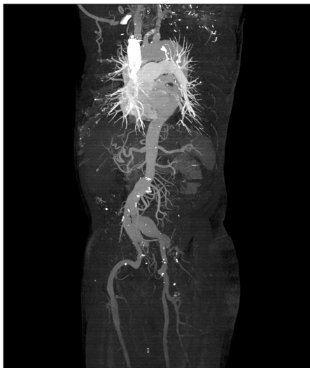
Fig. 1. Maximum intensity projection image shows significant aneurysmal dilatation of abdominal aorta and both iliac arteries.

Initially, a custom-made 15-Fr delivery right internal iliac branched device (IIBD, SEAL Bifurcated stent graft, S&G Biotech, Seoul, Korea) was introduced in right femoral artery and oriented under fluoroscopic guidance with the aid of the gold markers. The delivery sheath was withdrawn, and a 0.035-inch guidewire was reintroduced through the branched limb under fluoroscopic guidance from the contralateral femoral artery. After exchange for a stiff guidewire, an 8-Fr internal iliac stent-graft (IISG, SEAL Branched limb extension, S&G biotech, Seoul, Korea) was placed in the IIA