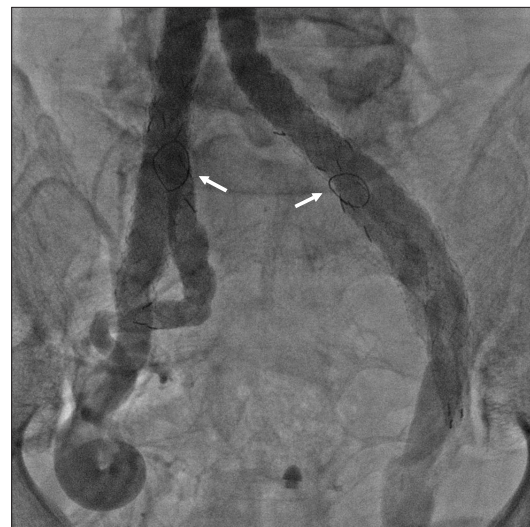
Fig. 2. Final angiogram after graft-stent implantation shows no endoleak at both common iliac and internal iliac arteries. White arrows indicate the gold markers, which orient and aid the appropriate branched stent positioning under fluoroscopic guidance.