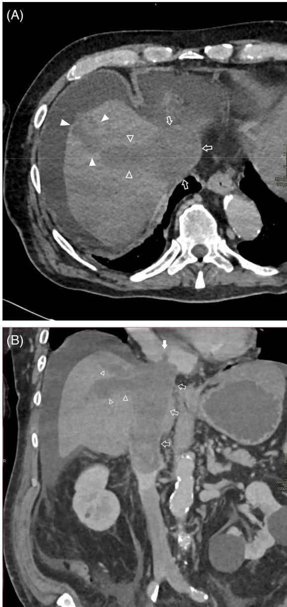
FIGURE 1 Axial (A) and coronal (B) contrast-enhanced computed tomography shows a 4-cm wide hepatic mass (arrowheads) invading the right sub-hepatic vein (voided arrowheads) and inferior vena cava (voided arrows). The invaded veins are enlarged, and the tumor thrombus extends to the right atrium (arrow). Peri-hepatic ascites are also present.