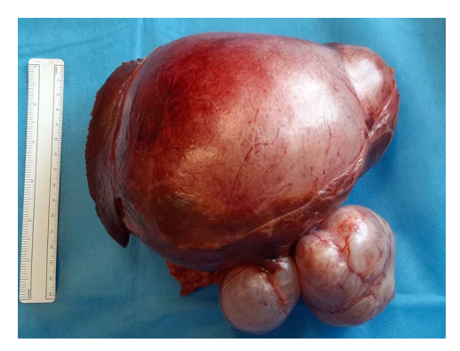
Figure 2. Resected left hepatectomy specimen showing the large, multiloculated cystic lesion arising from the left lobe of the liver.

transection plane was through Cantlie's line. At time of surgery, a large dominant cyst was noted, occupying the left lobe of her liver, with complex loculations extending inferiorly but contiguous with the liver and not invading adjacent structures, weighing 1807 g (Fig. 2).