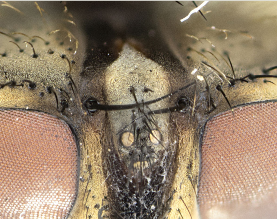
Figure 5. doi

Occipital view of Chorotegamyia aureofacies sp. n. highlighting distinctive gold ocellar triangle reaching posteriorly into occiput; image from male holotype.