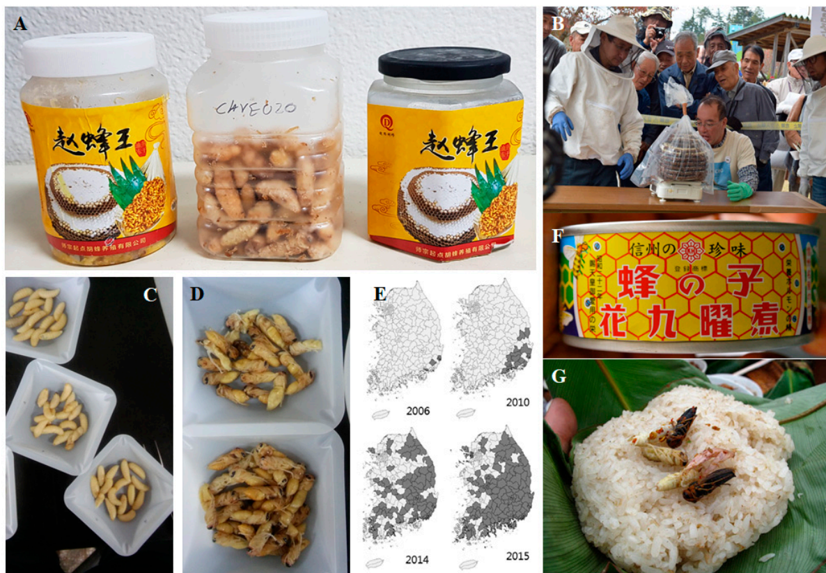
Figure 1. (A) bottled hornet larvae sold in China; (B) hebo ( Vespula sp.) contest in which judges evaluate wasp nests by weight in search for the largest nest of domestically raised wasps. [Photo credit: Soleil Ho; source: https://www.splendidtable.org/story/the-japanese-tradition-of-raising-and-eating-wasps , accessed on 31 August 2019]; (C) larvae of Vespa velutina collected from the forest near Andong (Korea); (D) pupae of Vespa velutina collected from the forest near Andong (Korea); (E) range expansion of the invasive hornet Vespa velutina in Korea [Source: 19]; (F) canned hachinoko (wasp brood) in Japan; (G) practice of eating wasps in Yunnan province [Source: http://tearchin.blogspot.com/2011/10/weird-things-ive-eaten-in-yunnan.html , accessed on 31 August 2019].

The preparation of the wasp and hornet brood for consumption varies. The most common method of preparation includes deep-frying or frying with chicken eggs as in Yunnan, but the Dai people of southern Yunnan prefer to steam larvae and pupae together and mix them with vinegar and other seasonings [1]. Korean people also prefer frying and roasting [2], whereas Japanese people cook or preserve the wasps using soy sauce and mirin (sweet cooking rice wine) [8]. Although in Korea hornets are not considered a common food, they did, however, feature in the armamentarium of Korean traditional medicine. Polistes and Vespa larvae and adults are used as therapeutics for different ailments [9,10].