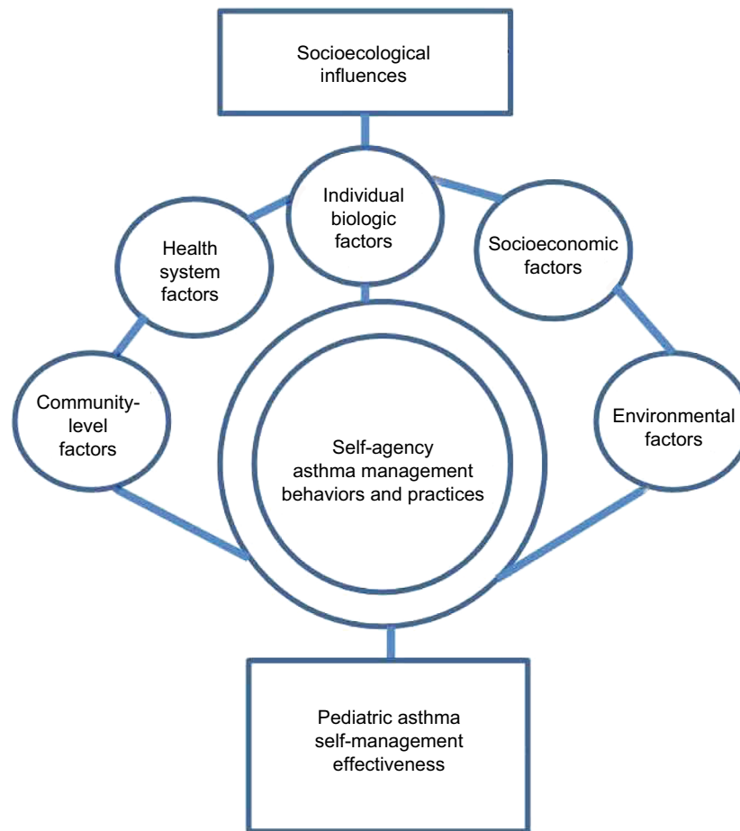
Figure 1 A conceptual framework for measuring self-management effectiveness among pediatric asthma patients and families.

self-management by patients/families. 55–58 According to Bodenheimer et al, self-management is crucial in enabling a rewarding lifestyle for individuals living with chronic disease, since it enables patients to be informed and educated to participate in their own care (including decisions related to their treatment options), to gain a sense of control over their lives, which in turn can serve to reduce the frequency of physician visits, and improve quality of life. 59–62