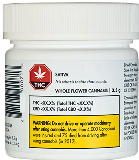
Note. Canada (similar to Uruguay) requires cannabis products to be sold in plain packaging