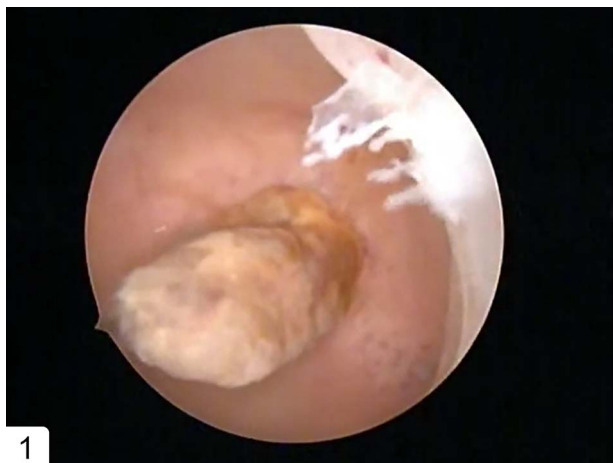
Figure 1: Hysteroscopy showing a polyp-like mass in the uterine cavity.