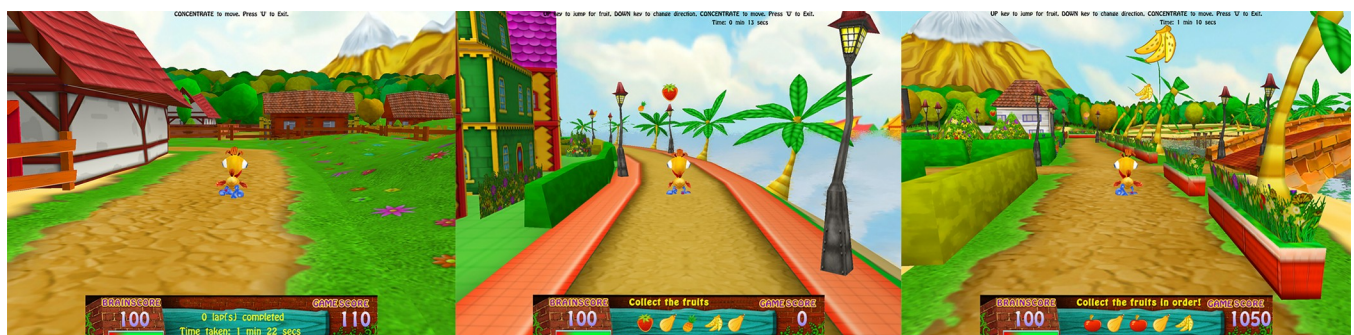
Fig 2. Cogoland game interface. There are three difficulty levels in Cogoland. The main goal of the basic level (left) is to drive the avatar around the island to complete as many laps as possible in ten minutes. The intermediate level (middle), participants are to drive the avatar around the island and collect fruits item presented at the bottom of the screen. At the advanced level (right), participants are to collect the fruits in order as presented on screen. Participants will use a specific key on the keyboard provided to make the avatar jump to collect the fruits. During each training session, participants will complete two 10-minute games, and a short break will be provided between the games.

The following questionnaires were chosen to assess the treatment outcomes at various time-points. With reference to the Gantt schedule (S1 Fig), the 'intensive phase' refers to the 8 weeks of intervention for both groups, 'maintenance phase' is represented by the subsequent