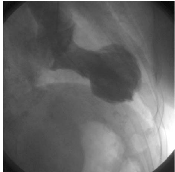
Figure 2. Left ventricular (LV) angiography showing severe mitral regurgitation and apical ballooning.

a further decline of the LV function. 5 The changes in the presynaptic myocardial sympathetic activity can be assessed with the radio-labeled noradrenalin analog 123 I-MIBG. 6 However, it has been shown that some \beta -adrenoreceptor-blockers may influence myocardial 123 I-MIBG uptake. This has also been suggested for