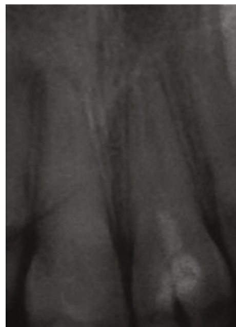
FIGURE 6: 6-month follow-up radiograph after revascularization: thickening of the wall with the beginning of root calcification on 21.

Due to their anatomical complexities, the treatment of immature necrotic teeth remains a challenge for the clinician [6]. The achievement of a conventional endodontic treatment is impossible due to the open apex and the weak root structure.