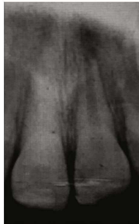
FIGURE 3: 6-month follow-up radiograph: a radiolucent periapical lesion adjacent to 21. The negative response to the cold test confirms pulp necrosis.

performed with 2% sodium hypochlorite followed by irrigation with saline solution. Subsequently, the root canal was dried with large paper points until they were removed without evidence of fluids and filled with calcium hydroxide used as intracanal medication. A temporary restoration using a glass ionomer was placed.