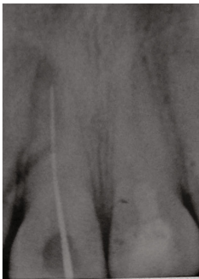
FIGURE 7: 24-month follow-up radiograph of 11: an apical barrier was formed easily crossable with a file.