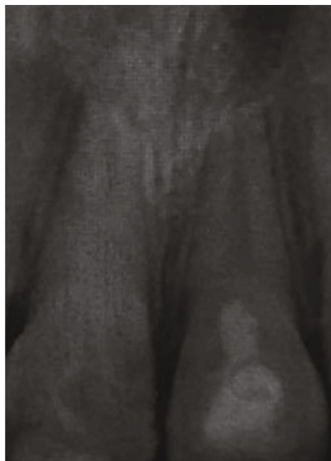
FIGURE 5: 3-month follow-up radiograph after revascularization: beginning of root edification on 21.

The completion of root development and closure of the apex occurs up to 3 years after the eruption of the tooth [5]. During this period, the tooth is exposed to several forms of aggression. According to Andreasen et al., 30% of pulp necrosis on immature permanent teeth is a consequence of dental trauma [1]. The crown fracture and the periodontal tissue injuries were responsible for the pulp necrosis in the clinical case.