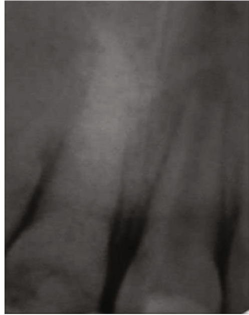
FIGURE 2: Retroalveolar radiograph showing the calcium hydroxide filling of 11.

An access cavity was made under a dental dam. Once the canal orifice was well cleared, gentle root canal irrigation was