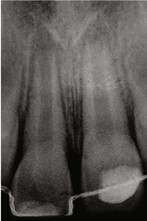
FIGURE 1: Retroalveolar radiograph. The tooth had immature roots (Nolla's stage 8).

Clinical examination revealed that the child has a flexible splint on maxillary teeth and a coronal restoration with a glass ionomer on 11. Radiographic examination showed incomplete root formation of both central incisors (Nolla's stage 8: short root with thin walls) (Figure 1).