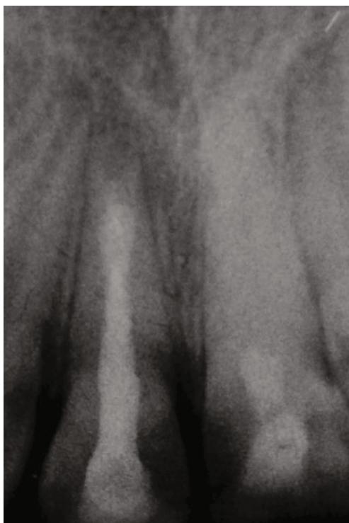
FIGURE 8: Root canal plugging of 11: MTA+gutta. Complete root canal obliteration of 21.

The American Association of Endodontists defined this technique as “a method to induce a calcified barrier in a root with an open apex or the continued apical development of an incomplete root in teeth with necrotic pulp” [7]. This calcified barrier is induced by several materials including calcium hydroxide. Indeed, this material has a potential to induce the osteodentin barrier formation. However, this therapeutic