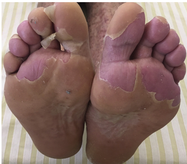
Fig. 2. Plantar desquamation after treatment with intravenous immunoglobulin.

as well as oral aspirin at a dosage of 160 mg/day. Over the following 3 days, an improvement was seen in the patient's general state with apyrexia. Striking periungual and palmoplantar desquamation was also observed (Fig. 2). The patient returned home on Day 7, and as a precaution, he did not receive a second dose of the Pfizer/BioNTech COVID-19 vaccine.