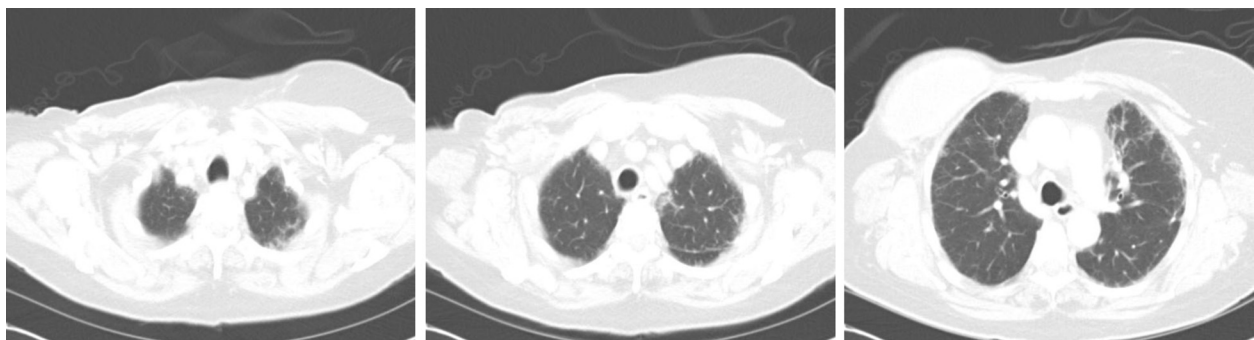
Figure 3 Computed tomography scan approximately three months later showing improvement of interstitial pneumonitis.

An attempt to pursue a needle lung biopsy at the outside hospital was complicated by a pneumothorax that required chest tube placement. Our patient was then transferred to the University of Miami hospital, for a thorascopic-guided wedge biopsy. Microscopic examination of the lung tissue revealed subacute interstitial pneumonitis evolving into areas of chronicity characterized by the presence of widening of alveolar septae with mild mononuclear infiltrates, collections of eosinophils, and pneumocyte injury (Figure 2). The latter was manifested by the presence of conspicuous Mallory body-like inclusions in hyperplastic pneumocytes. Areas of honeycombing were seen in the subpleural spaces. There was no evidence of any associated malignancy. Our patient was started on corticosteroids with rapid improvement of her dyspnea. Approximately one month later after her presentation to the emergency room, she no longer