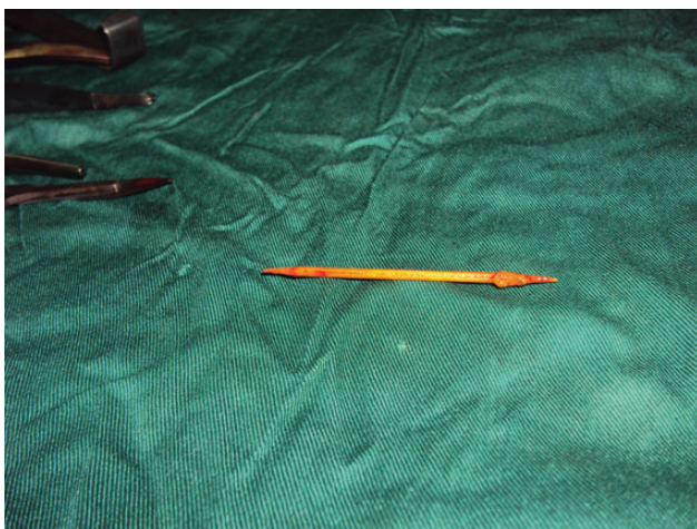
Figure 2: The wooden toothpick immediately after removal.

omentum and a small bowel contributing to circumscribe the infectious process. A wooden toothpick is discovered, partially in the peritoneal cavity, perforating the anti-mesenteric border of the splenic flexure of the colon (Fig. 1). The toothpick is removed (Fig. 2) and the perforation of the colon closed with an absorbable polyglactin suture and protected with an omentum patch.