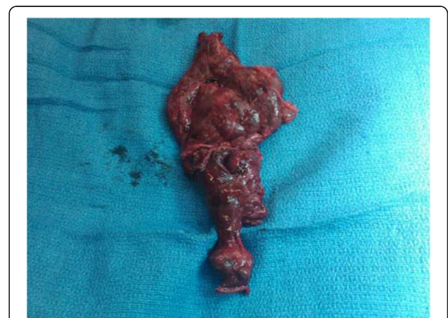
Figure 3 The specimen comprised multiple irregular, tan-pink, soft, multilobar tissues, including the following sizes, 11.5- x 9.0- x 1.5-cm (80 g, shown), 3.5- x 2.0- x 0.9-cm, 2.0- x 1.5- x 1.0-cm, and other multiple small fragments.

Thoracic splenosis, first reported by Shaw and Shafi in 1937 [6], describes the autotransplantation of splenic tissue into the pleural cavity after splenectomy for traumatic or iatrogenic injury, resulting in multiple nodular implants on the left pleura. Autotransplanted spleens differ from accessory spleens by blood supply, local perforator arteries versus splenic artery respectively [7]. Thoracic splenosis occurs less frequently than does abdominal splenosis and may be found in 18% of patients after splenic rupture. However, its frequency is likely underestimated because most splenic implants are asymptomatic and are only incidentally discovered during chest X-ray or CT. The average interval between initial trauma and diagnosis of thoracic splenosis is 18.8 years [5]. The splenic implants are sessile or pedunculated reddish blue nodules ranging from a few millimeters to 7 cm in diameter [8]. To our knowledge, the size of the present case is the largest among those in previously reported intrathoracic splenosis. The current diagnostic modality of choice for splenosis is noninvasive nuclear scintigraphy. ^{99m}\text{Tc} sulfur colloid scintigraphy was first used to diagnose splenosis based on the ability of the radiolabeled colloid to localize in the reticuloendothelial system. However, scintigraphy using ^{99m}\text{Tc} heat-damaged erythrocytes or indium 111-labeled platelets is more sensitive and specific for splenic uptake, making