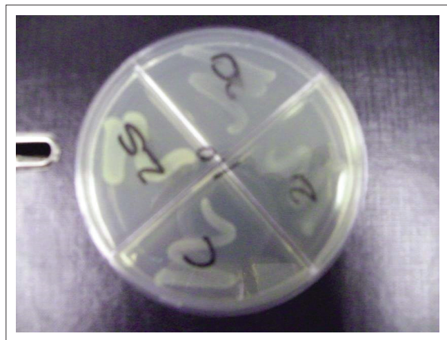
FIGURE 1: Adapted mutant prevention concentration method plate – With C being the control, the other each section an antibiotic dilution.

XLD, xylose lysine dexycolate; H 2 S, hydrogen sulfide.