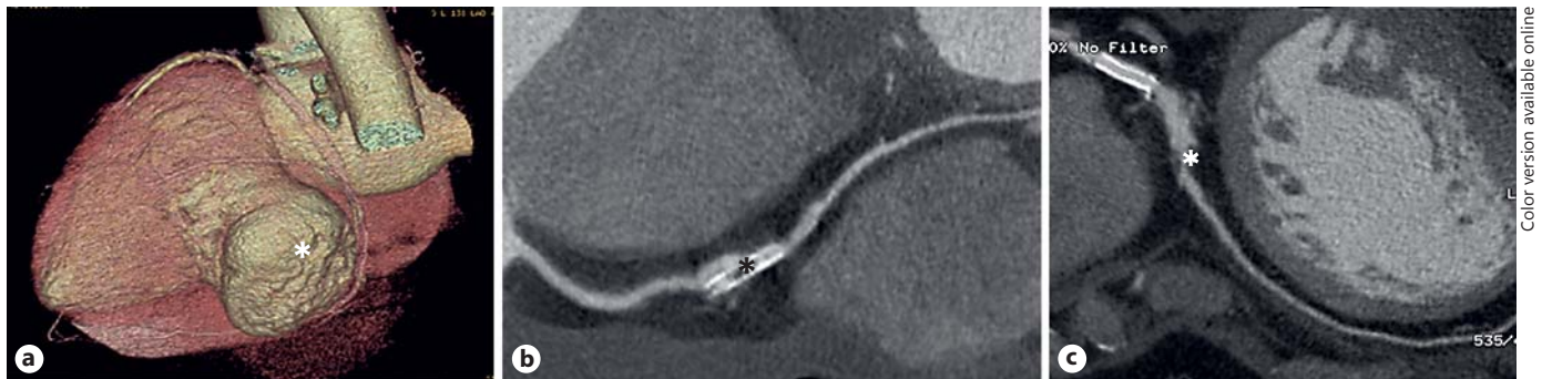
Fig. 2. Preoperative cardiac CT scan findings. a Aneurysm of the LV inferior wall (asterisk) after iatrogenic myocardial ischemia. b Right CAA with dislocated stent. The asterisk indicates intrastent occlusive stenosis. c Patency of stent in proximal LAD and significant stenosis (asterisk) of the middle tract.

a stent was performed to exclude the CAA. The procedure was complicated 24 h later by inferior acute myocardial infarction despite an attempt at percutaneous revascularization, which unfortunately failed.