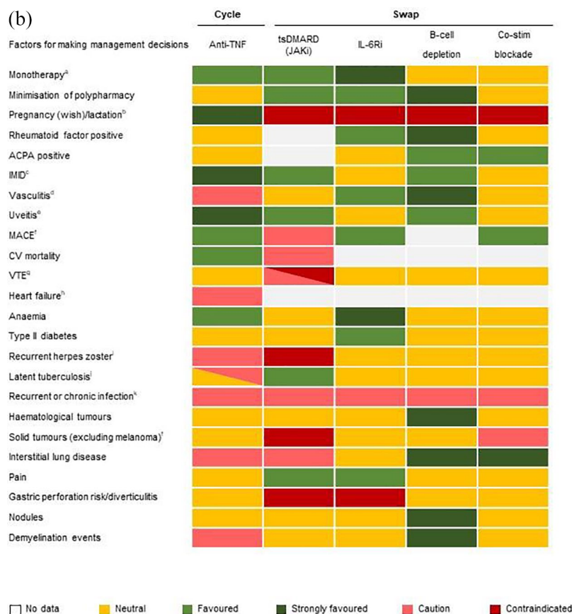
Figure 1. (a) Decision tree for treatment selection following first-line anti-TNF therapy. (b) Treatment options following first-line anti-TNF therapy considering patient characteristics a (supporting references can be found in Supplemental Appendix Figure 1).

ACPA, anti-citrullinated peptide antibodies; CV, cardiovascular; IMID, immune-mediated inflammatory diseases; MACE, major adverse cardiovascular event; VTE, venous thromboembolism.