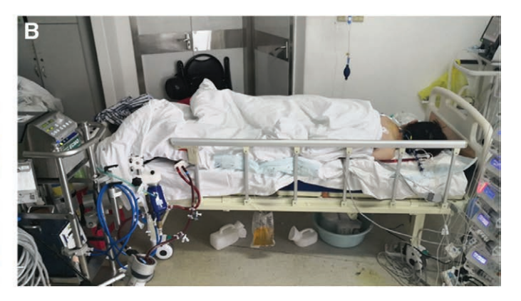
Fig. 9. Prone position ventilation for critically ill patients with COVID-19. (A) An intubated patient turned prone; (B) an intubated patient with extracorporeal membrane oxygenation support turned prone.