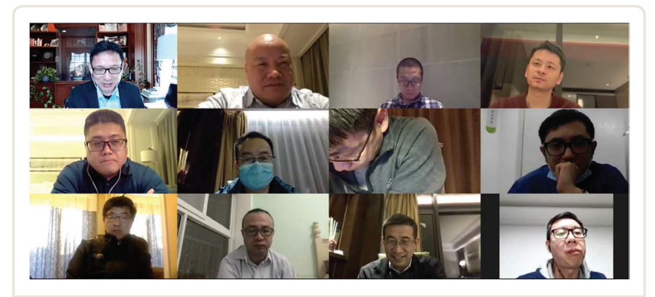
Fig. 2. Screenshot of the fourth webinar with live broadcast conducted on February 29, 2020. A total of 12 intensivists and anesthesiologists (10 people from China; 2 people from the United States) discussed the experience of using extracorporeal membrane oxygenation amid the COVID-19 outbreak. Nine of the 10 Chinese experts are currently working in Wuhan and taking care of critically ill patients with COVID-19. Most of these Chinese experts stay in hotels because they came from other provinces to Wuhan to share the workload that had overwhelmed the local teams.

COVID-19 is acute hypoxemic respiratory insufficiency or failure requiring oxygen and ventilation therapies (fig. 3).<sup>3,4</sup> A recent report showed that 14% of patients developed dyspnea, tachypnea with a respiratory rate greater than or equal to 30 per minute, desaturation with peripheral oxygen saturation (Spo<sub>2</sub>) less than or equal to 93%, poor oxygenation with a ratio of partial pressure of arterial oxygen (Pao<sub>2</sub>) to fraction of inspired oxygen (Fio<sub>2</sub>) less than 300 mmHg, or lung infiltrates greater than 50% within 48 h.1 ARDS occurred in 20% of the 138 patients hospitalized and in 61% of the 36 patients admitted to the intensive care unit (ICU) in Zhongnan Hospital in Wuhan.<sup>4</sup> Organ dysfunction, injury, or failure, excluding the lungs, is common. Cardiac injury occurred in 23%, liver injury in 29%, and acute kidney injury in 29% of critically ill patients.<sup>3</sup> Neurocognitive impairments occurred in more than one third of patients with advanced COVID-19.7