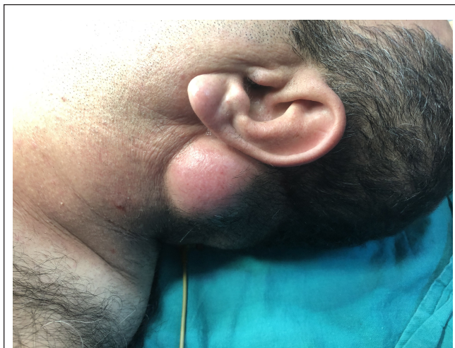
Figure 2. 7 × 8 cm lipomatous mass.

A 53-year-old male patient in the American Society of Anesthesiologists III (ASA III) Group with previously known diabetes mellitus, hypertension, and previous cerebral embolism was admitted to the anaesthesia outpatient clinic. The patient had a 7 × 8 cm lipomatous mass behind the left ear and was scheduled for surgery due to intense cosmetic