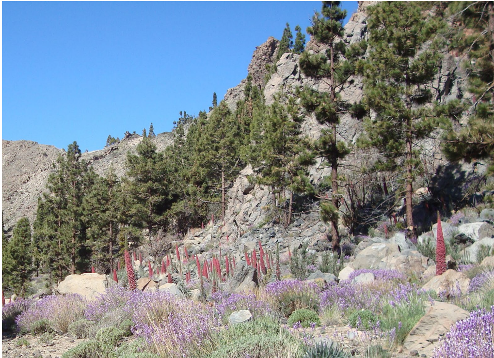
Fig. 7 Winner, Landscape ecology and ecosystems: Las Cañadas del Teide. “Micro-habitat on the north-facing caldera slopes at 2100 m altitude in ‘Las Cañadas del Teide’ on Tenerife Island, Spain. Shown here is a rare mixture of the Canary pine ( Pinus canariensis ) and the flowering endemic Teide bugloss ( Echium wildpretii ), amongst other plants, such as the rosalillo de cumbre ( Pterocephalus lasiospermus ). The unique geological environment and geomorphological development created a specific micro-habitat, perfectly suitable for both the Canary pine trees invading from outside the caldera depression and the ‘Tower of Jewels’ or ‘Red bugloss’, a rare species fully adapted to survive in this harsh terrain. The micro-habitat is formed by coarse rock fall deposits, piling up at the foot of the >3 million years old basaltic cliffs, creating local scree slopes. Locally, fine-grained sub-horizontal soil patches form behind larger fallen blocks, as the result of fine-scale surface runoff and sediment transport and deposition, which, in combination with mechanical and chemical weathering, release sufficient nutrients from the basaltic parent material to sustain this unique vegetation cover. Signs of forest fire, especially on the pine trees, emphasize the vulnerability and dynamic nature of this ecologically fragile (micro-)ecosystem.”

takes a while (but not too long) to notice the Littoraria hiding, presumably from hot sun and predators.”