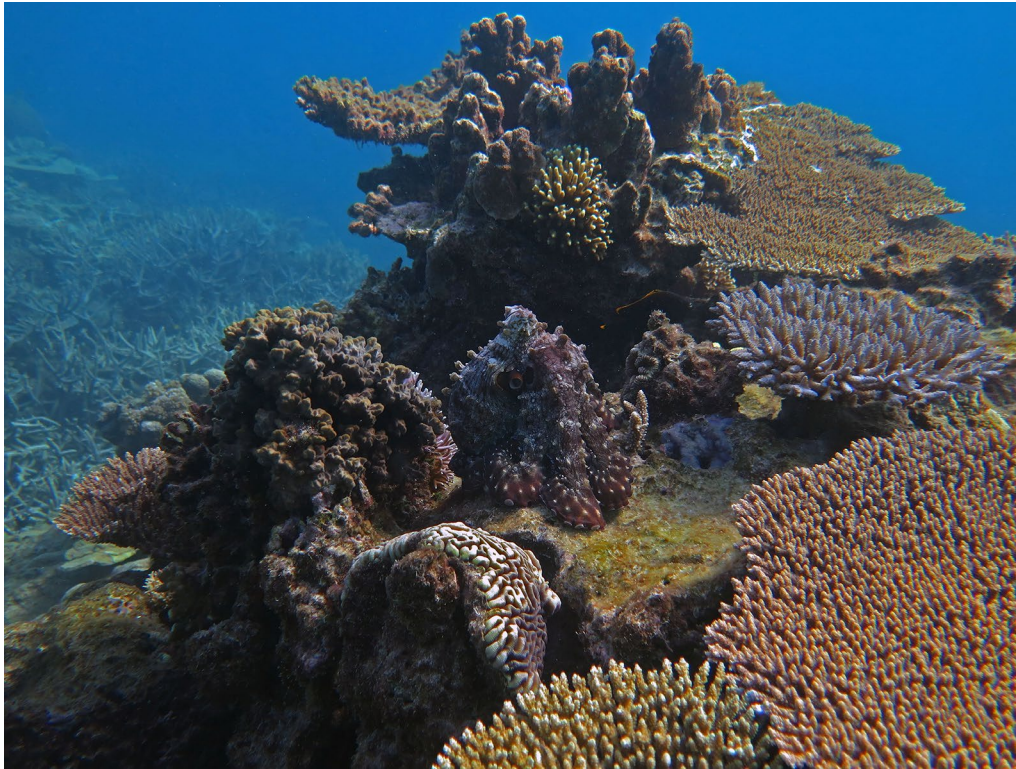
Fig. 8 Winner, Editor's pick: A "well-armed" coral reef community. "The underwater equivalent of tropical rainforests, healthy coral reefs teem with life. Often conspicuous, other times a little harder to spot. Like this octopus, that pretended to be a coral as I approached it. The complex three-dimensional framework that corals build provides a sheltered habitat and ideal camouflage ground to approximately ¼ of all marine species, even though reefs are just specks in our oceans. It is hard to imagine however how a bleached or dead reef could host such biodiversity, an alarming thought given the back-to-back global bleaching events of 2016 and 2017. Heron Reef, along with other reefs in the southernmost section of the Great Barrier Reef, may have escaped the bleaching that hit the warmer northern section this time round, but how well-armed these reefs are against intensifying climate change and other anthropogenic pressures is questionable." Attribution: Michelle Achlatis