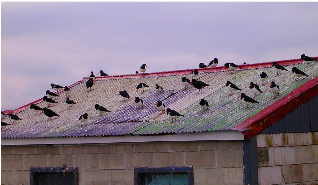
Fig. 5 Winner, Community, Population and Macroecology: Catchers on a hot tin roof. “ Early morning oyster catchers assemble on the roof of a disused boat shed on the Otago Peninsula, South Island, New Zealand ”

For the swallow-tailed gull, mating involves a substantial lifestyle change. The gulls spend most of their lives out at sea, only returning to land to breed. Majoi de Novaes Nascimento captured a gull perched high up on a cliff face at their breeding grounds on the Galapagos Islands (Additional file 9).