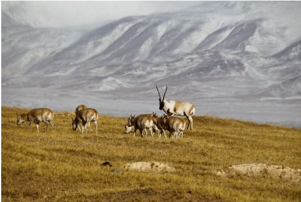
Fig. 6 Winner, Conservation ecology and biodiversity: Tibetan antelope. “On January 12, 2016, at the foot of white snow covered Kekexili Mountain, a male Tibetan antelope was vigorously guiding a herd of female which would come to estrus soon. Tibetan antelope have a harem mating system, in which a dominant male who defeated other male competitors during rut will have a harem of several to dozens of females during the rutting season in the coldest month of the year. Tibetan antelope are an endemic species to the Qinghai-Tibetan Plateau. Its population once reached several millions on the alpine meadows in the heartland of the plateau. However, the population of Tibetan antelope dramatic decreased to 70–80 thousands after the mad poaching for its precious wools at the end of 20th century. Since then, populations of Tibetan antelope (Chiru, Pantholops hodgsonii) have been gradually recovering under strict protection. The status of Tibetan antelope was down listed from “Critically endangered” to “Valuable” in the 2015 China’s Biodiversity Red List.”