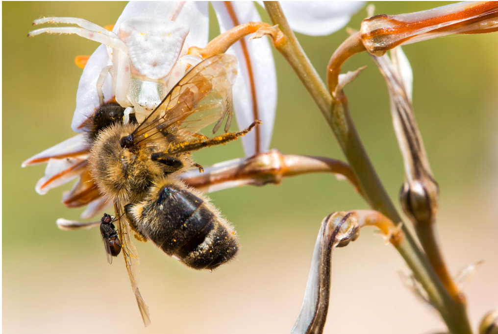
Fig. 3 Second runner-up: Connections. “Conservation cannot be understood without taking into account the interaction among species. The disappearance of one species might provoke that other connected species (prey, predators, etc.) can suffer direct consequences. This picture represents the predation of a crab spider on a bee and this was used by a parasitic fly.”

plant species recorded on the seven volcanic islands of the archipelago, more than 500 are endemic to this small area. There are also endemic animal species, including reptiles, birds and mammals. The beauty of many endemic species, like the Teide bugloss ( Echium wildpretii ) or the blue chaffinch ( Fringilla teydea ) should not make us forget how fragile they are. Endemic species have usually a low number of individuals and are restricted to small areas that are threatened by human activities. This is perfectly exemplified by the description written by Harry Seijmonsbergen of the complex processes required for the creation of the microhabitat illustrated in the winning picture. The preservation of endemic species on islands is thus a paradigm for biodiversity conservation everywhere on Earth.”