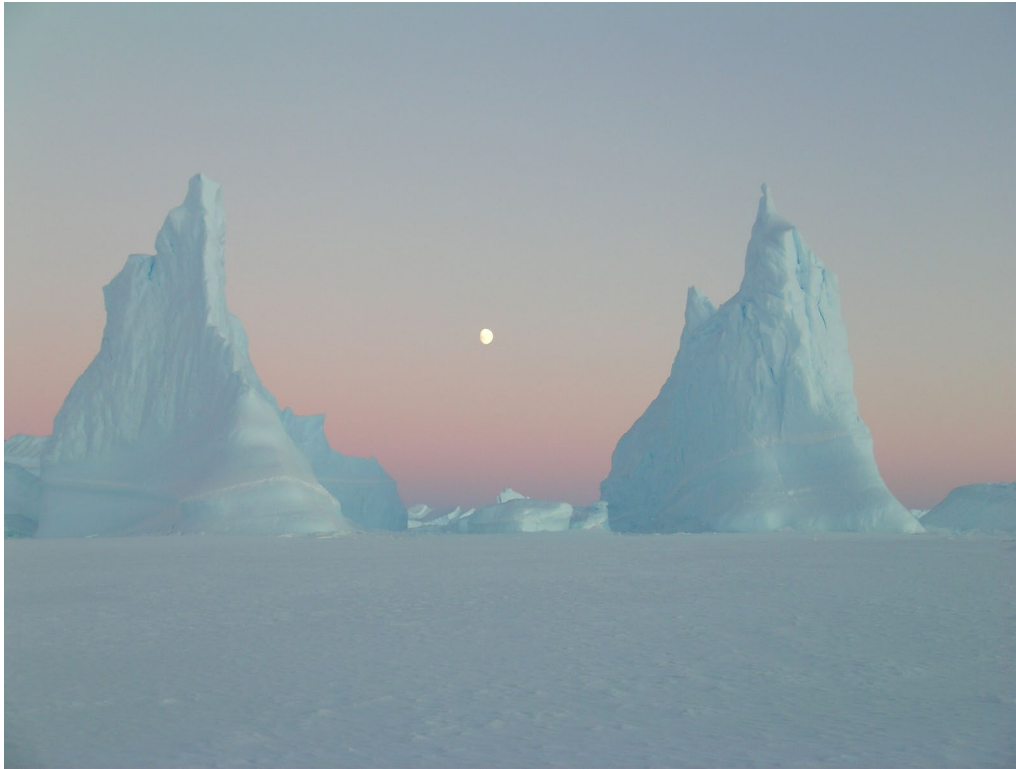
Fig. 2 First runner-up: Two towers. “The tranquil and frozen East Antarctic sea ice landscape in the winter months showing off its amazing pink skies and fantastic icebergs. During my PhD I spent over a year at Davis station in the Australian Antarctic Territory doing research on two freshwater lakes in the Antarctic lake oasis known as the Vestfold Hills. I was lucky to capture these “two towers” and the striking moon on a sea ice trip near the Davis station in June 2004.” Attribution: Christin Säwström

time, the ant calls for the viewer’s attention as if claiming that if it was not for its guarding it, then the most important thing in the whole world would be lost.”