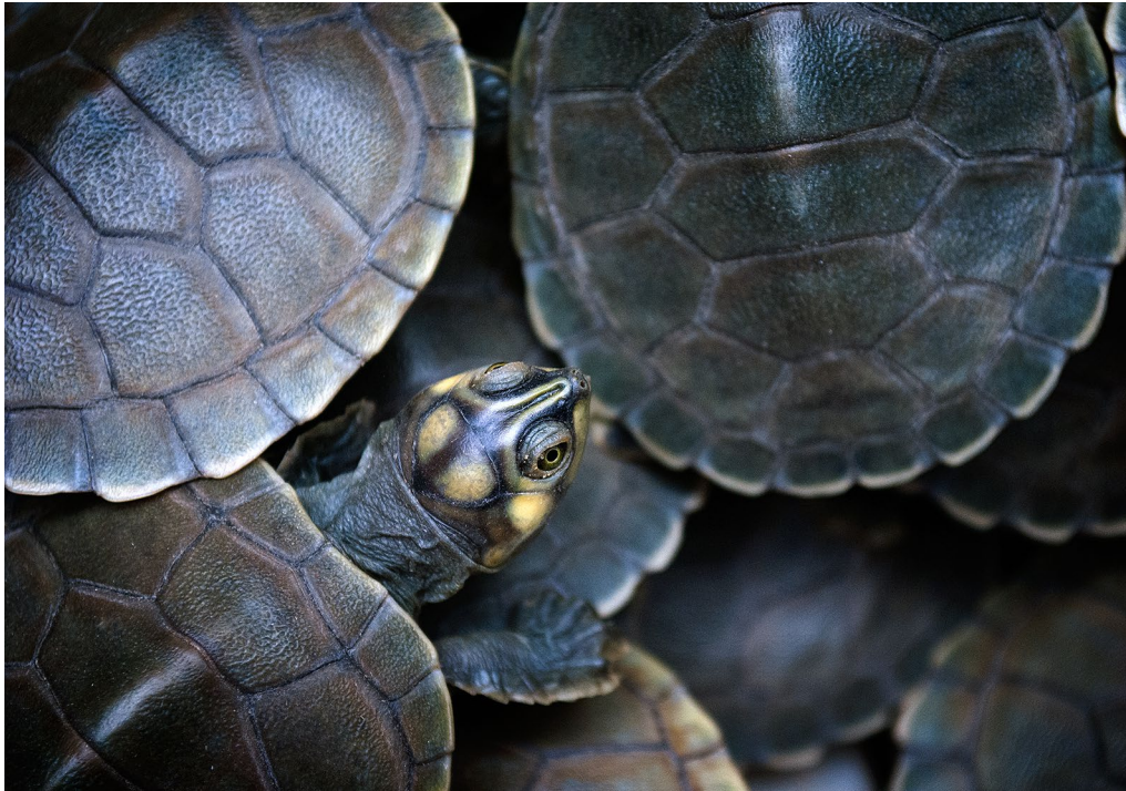
Fig. 1 Overall winner: Podocnemis expansa. “The Giant South American turtle ( Podocnemis expansa), also known as the tartaruga-da-amazônia, is the largest of the side-neck turtles. This picture was taken in one of the most important areas of conservation for this species: the Cantão State Park, in Tocantins, Brazil. The Park is located in the Brazilian “Savanna” or Cerrado, a biodiversity hotspot that is yet poorly known but is thought to be equally or even more biodiverse than the Amazon ecosystem. I was there as part of a research group working in the field to collect data on the status of reptiles and amphibians’ populations for conservation purposes.”