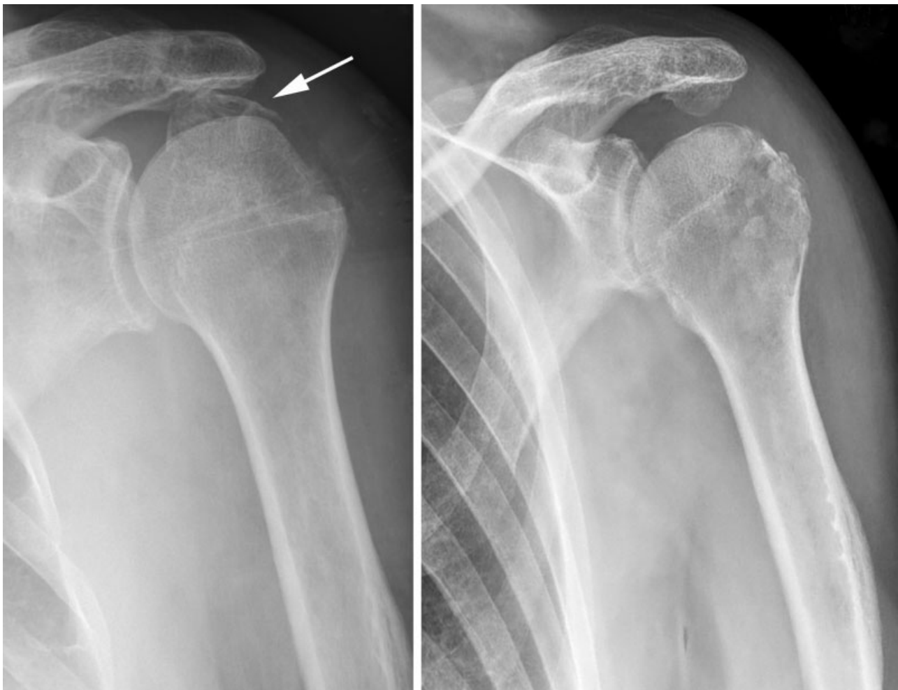
Fig. 2 Preoperative and postoperative X-rays showing the initial displacement and the final result in one case.

Outcomes of surgical treatment of GT fractures are good to excellent in 80 to 100% of the patients. 1 Tension-band fixation seems to produce less favorable results, though