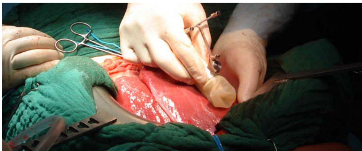
Figure 2 Step II, registration of the preoperative planning on real patient anatomy using infrared optical localization device positioned on US-probe.