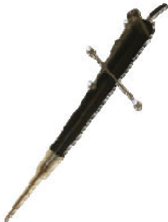
Figure 3 CUSA® dissector modified by the positioning of an infrared optical device for the navigation during resection.