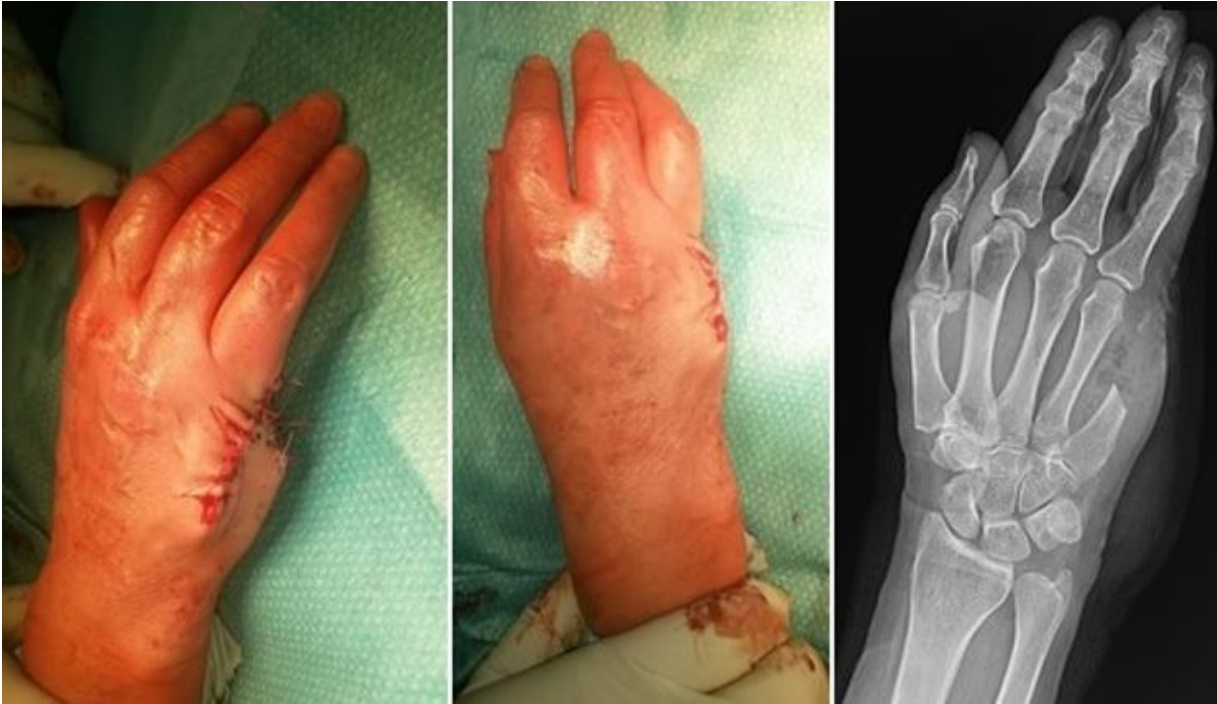
Figure 2: surgical and radiographic result immediately after surgery