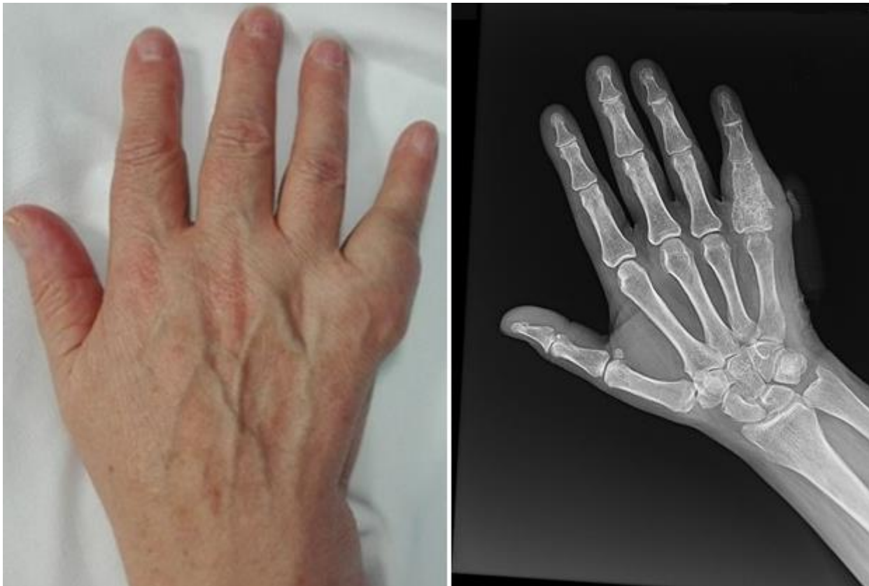
Figure 1: five years after surgery, the patient returns for pain, swelling and functional limitation; this image highlights the hand and the X-ray with evident recurrence of the pathology