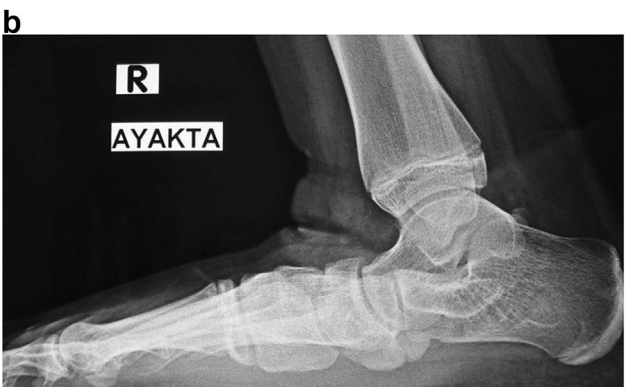
Fig. 1. a. Preoperative anteroposterior x-ray of foot. Notice accessory navicular bone. b. Preoperative lateral x-ray of foot. Notice accessory navicular bone and talar sag.