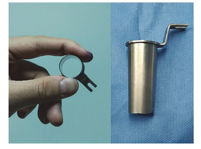
FIGURE 1: Zista tapered retractor is 22 mm in diameter on the upper end and tapers to a diameter of 18 mm at the opposite end.