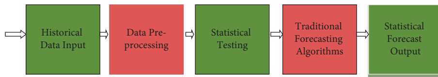
FIGURE 1: The traditional forecasting approach [41].

produced compared to that of the traditional method shown in Figure 1.