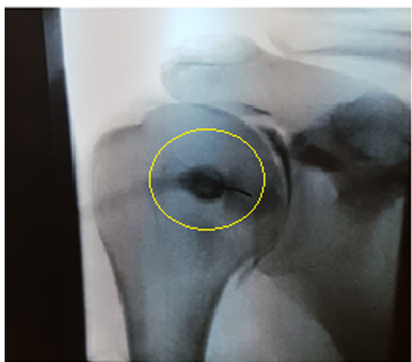
Fig. 3. X-ray films under fluoroscopy with intraarticular contrast showing cyst and fluid extravasation.

with spinoglenoid cysts may present with muscular atrophy, electromyography (EMG) is an essential diagnostic modality to assess the presence of any associated neurologic involvement responsible for the muscular deficit. An electromyography helps to differentiate if the compressive effect of the spinoglenoid cyst is on the supraspinatus and the infraspinatus or the infraspinatus only [1].