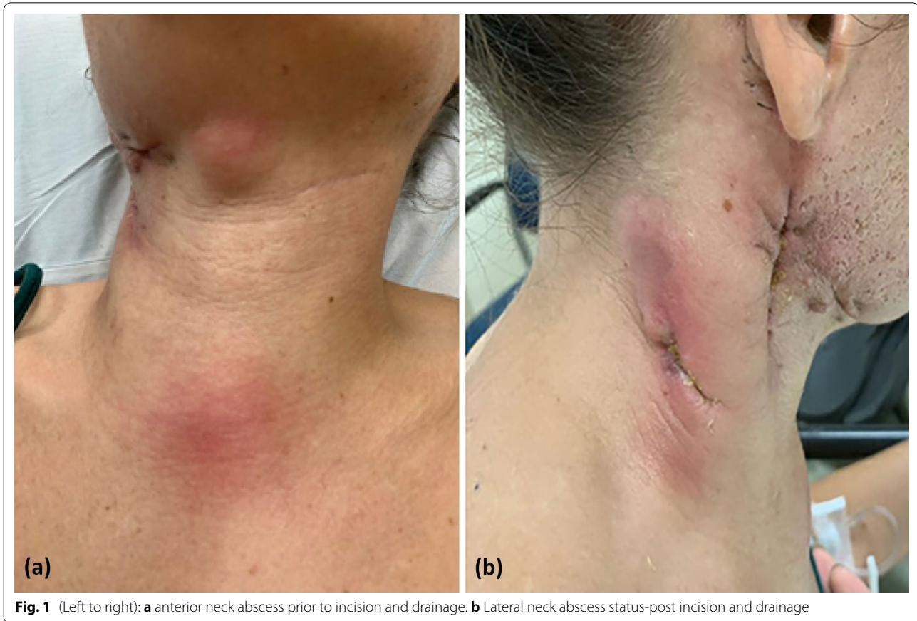
Fig. 1 (Left to right): a anterior neck abscess prior to incision and drainage. b Lateral neck abscess status-post incision and drainage

In addition to ITP, past medical history revealed several years of recurrent abscesses of the neck and perianal region with negative cultures. She had previously received rituximab for six weeks over a decade prior to presentation. In 2016 she had mycoplasma pneumoniae lasting six months (Fig. 2). She also was found to have pulmonary nodules which were biopsied, revealing granulomatous inflammation. Later that year, due to her history of ITP, pulmonary nodules, positive antinuclear antibody (ANA), positive ribonucleotide protein (RNP) antibody, family history of systemic lupus