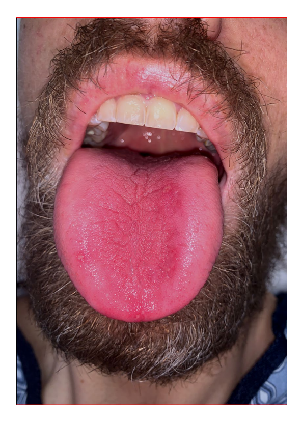
FIGURE 1 Image of patient's mouth revealing glossitis