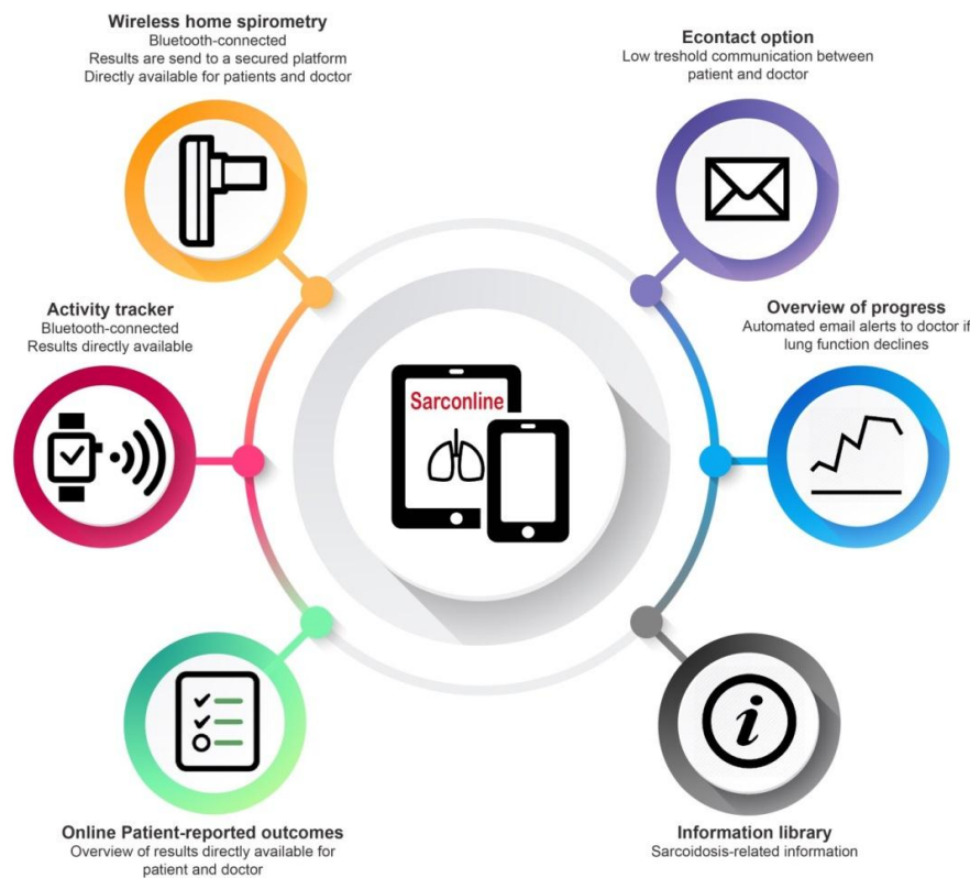
Figure 2. Overview of home monitoring program “Sarconline” with different components.

Sarconline is an online eHealth application developed for patients with sarcoidosis (Curavista, The Netherlands). It consists of a secured personal platform, in which patients can keep track of their own health-related data, such as pulmonary function tests, activity, quality of life questionnaires, symptoms, and medication (Figure 2). Patients directly see a graphical overview of their data. There is a possibility to communicate with the healthcare team by using the email functionality (eContact). Sarconline also contains news and information about sarcoidosis and links to useful websites. The patient owns the data and determines which healthcare providers can access his or her data. Data are stored on a secured and approved datacenter with ISO27001 certification, following European safety legislations.