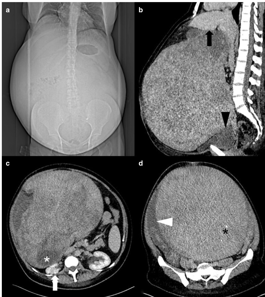
Fig. 1 CT reveals extensive abdominal enlargement in the scout view (a). Sagittal CT reconstruction depicts a giant tumor in contact with the liver (black arrow, b) and with the urinary bladder (black arrowhead, b). The mass contains necrotic components (white asterisk, c), as well as small calcifications (black asterisk, d). The preoperative situs shows compression of the right kidney (white arrow, c) and ascites adjacent to the tumor (white arrowhead, d)

than 30 cm. Macroscopically, the shape was irregular, with overall consistency being firm with few soft areas. The tumor was pinkish-red in color, similar to (smooth) muscle cells. On the surface, enlarged aberrant blood vessels were observed. The cervix appeared normal, as well as bilateral fallopian tubes, although they were enlarged. For further histopathological examination, a cut section (total of 38 blocks) was performed, and tissue sections were stained with hematoxylin and eosin and examined under a light microscope. The cut sections revealed a heterogeneous phenotype with predominant