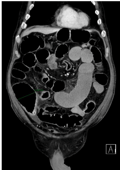
Fig. 3. Repeat CT on Day 4 of admission, highlighting ongoing resolution of pseudo-obstruction. Complete clinical resolution would require a further three days.

heart disease - a risk factor for neostigmine-related bradycardia, further preferences endoscopic decompression to acetylcholinesterase inhibitor