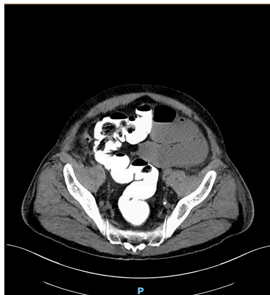
Fig. 2. CT-Abdomen with rectal contrast.

Furthermore, this precedent is supported in a retrospective study by Peker et al. 5 who noted that, in a group of 68 patients, those undergoing